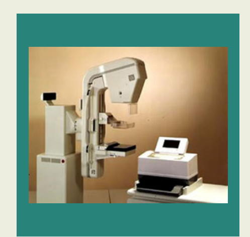
Ge Senographe DMR Plus Mammography System