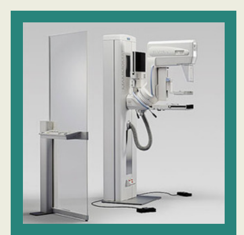
Siemens Mammomat 3000 Nova Mammography System