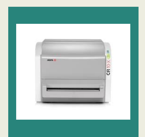
CR-10X Computed Radiography