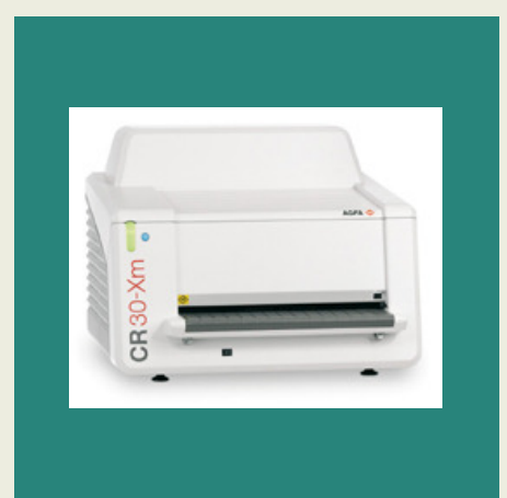
CR-30Xm Computed Radiography