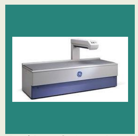
Bmd Dexa Ge Lunar Dpx Series Scanner