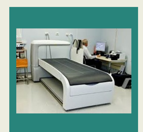
BMD DEXA Ge Lunar Prodigy Series Scanner