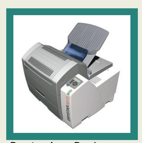
Drystar Axys Dry Imagers