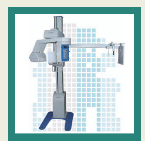
OPG 3000 Panoramic System