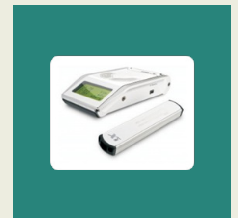
QA Services for Radiolgy equipment as per AERB Guidelines