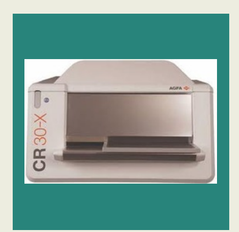
CR-30X Computed Radiography